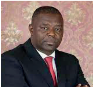
HON. GOSPEL KAZAKO Minister of Information